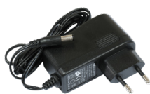
24 V 0.38 A power adapter

For links up to 200 meters, this is the best alternative for wireless connections where 2 and 5 GHz wireless space is crowded and unreliable, at a fraction of the cost. Small, lightweight, compact and very affordable, this is a 60 GHz device like no other before.