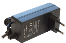
24 V 1.5 A power adapter