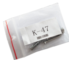
Wall mount set