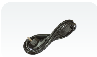
2 Power cords