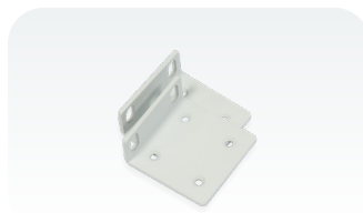
Rackmount bracket white