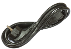
2 IEC cords