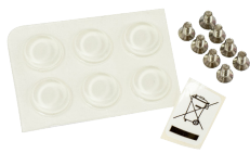
Screw and feet kit