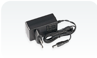
24 V 1.2 A power adapter